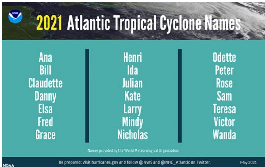
alphabetical list of the 2021 Atlantic tropical cyclone names as selected by the World Meteorological Organization. (NOAA)

For 2021 the following names are given to the storms: